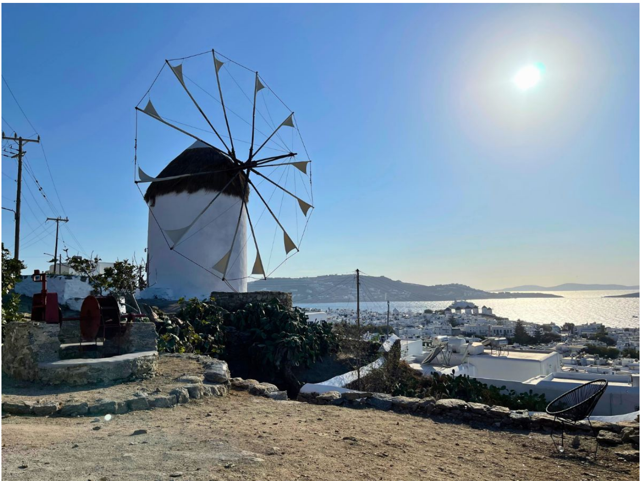
How to Get Around Mykonos

As a seasoned traveler who's experienced the charms of Mykonos first-hand, I'm here to share my insights.