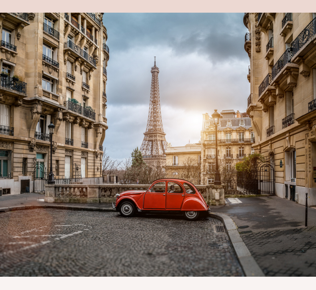
A Solo Woman Traveling www.asinglewomantraveling.com